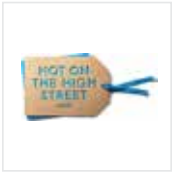
Not On The High Street