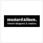
Mustard & Linen